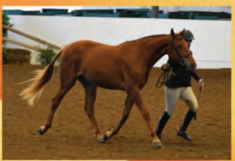
2018 granddaughter Bahama Mama