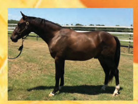
2018 son Shine to Perfection