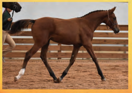
2020 daughter Shine a Light

Other young horses available. Please see our website for more information