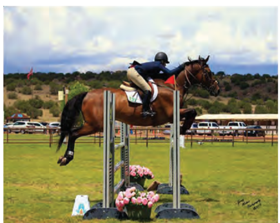
Boarding • Lessons • Training • Sales